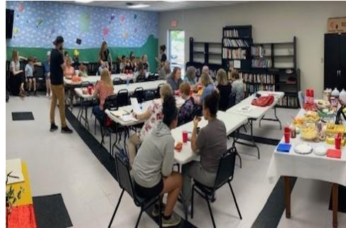
Guests and members enjoy snacks prior to program.